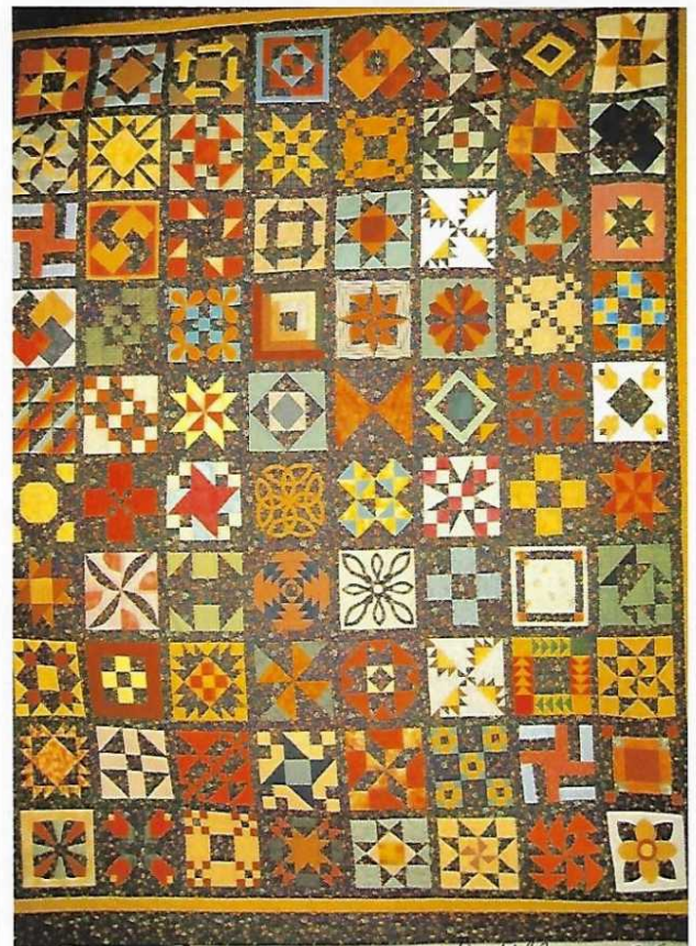
Both of these quilts were raffled in 2005