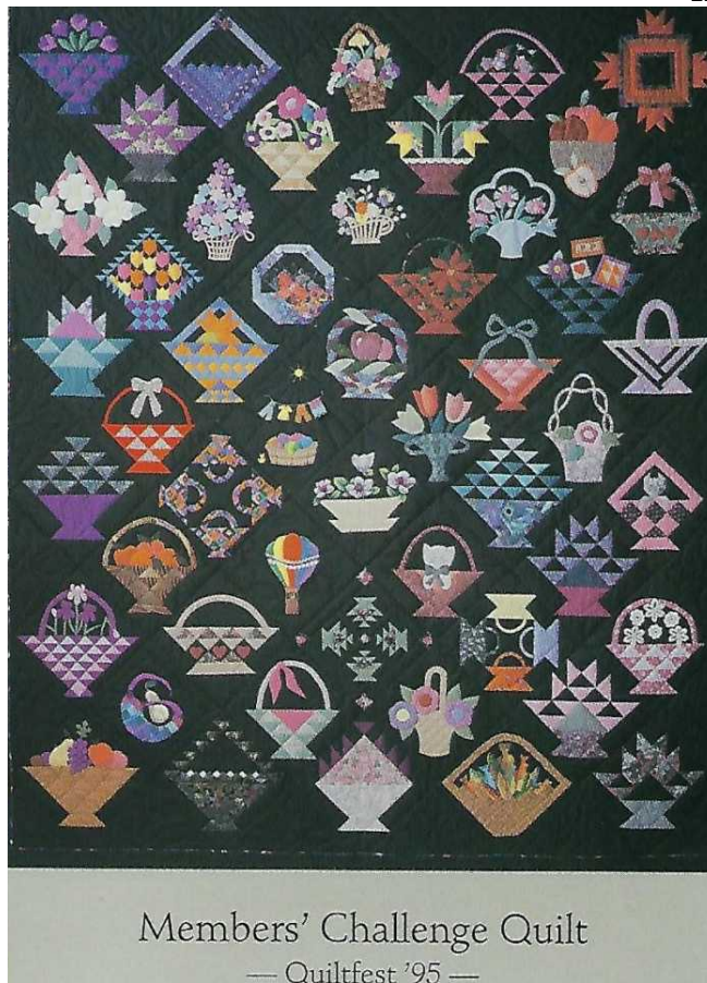
Above: Our 1995 Members' Challenge Quilt at Quiltfest '95. The exhibit was in the former Seagram Museum.