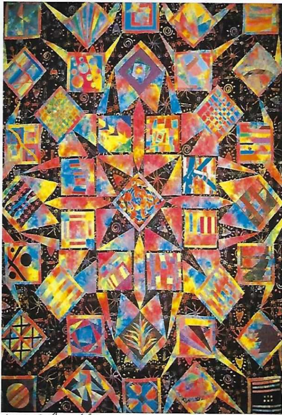
Scraps of Wisdom - April 2022