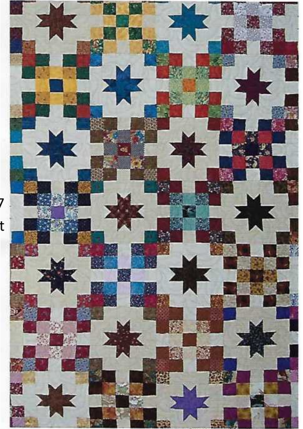
Right: 2007 Raffle quilt