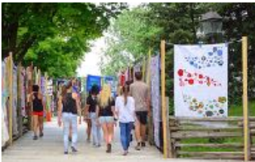
Sponsored by Hyggeligt Fabrics

We invite you to be part of this small quilt show, which will not only be big...It will be huge!